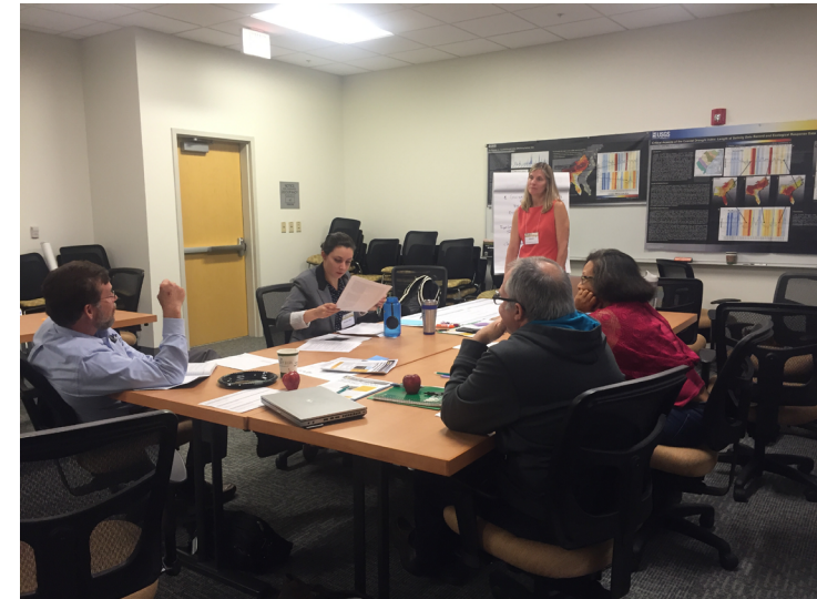
Meeting attendees participated in break out groups to identify needs, priorities, and project ideas for the development of the CC DEWS strategic plan.