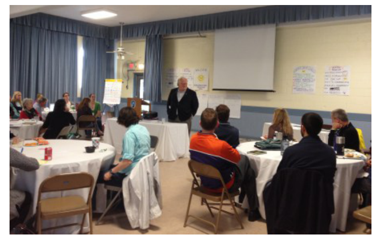
City of Beaufort, SC Mayor Billy Keyserling gives the keynote address to close the workshop.